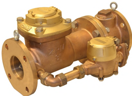
PMCB03 3 X 3/4

*NOTE: PMCB-08 Includes Bronze Strainer. Check valve and spool are Epoxy coated cast iron