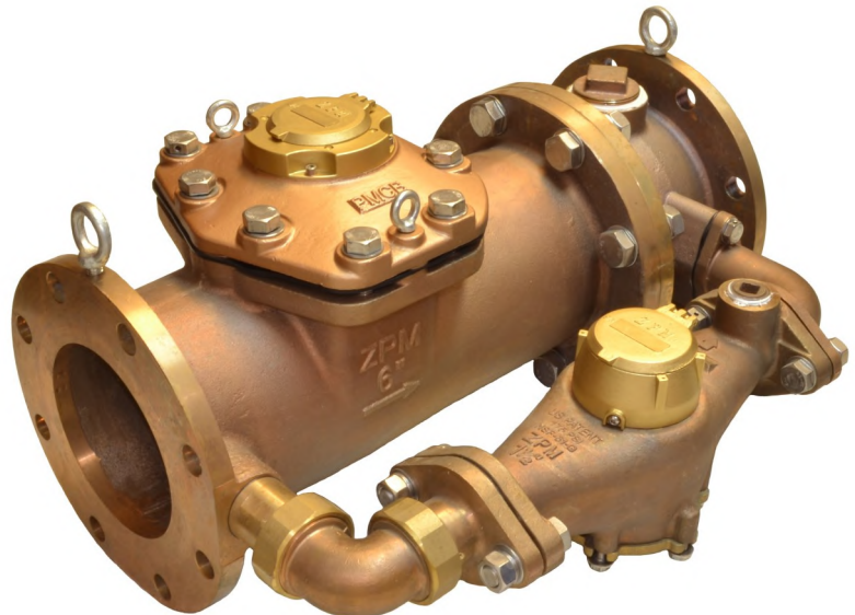
PMCB06 6 X 1-1/2