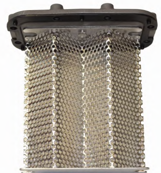
Large Built-in Z-Plate Strainer